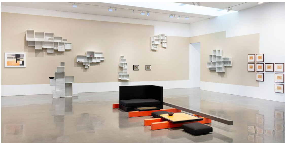
Installation view of Andrea Zittel. Works 2005 - 2020. Regen Projects, Los Angeles July 13 - August 21, 2020.